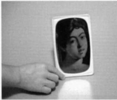
Above: Gustavo Caprin, Chamber Piece , 2005.